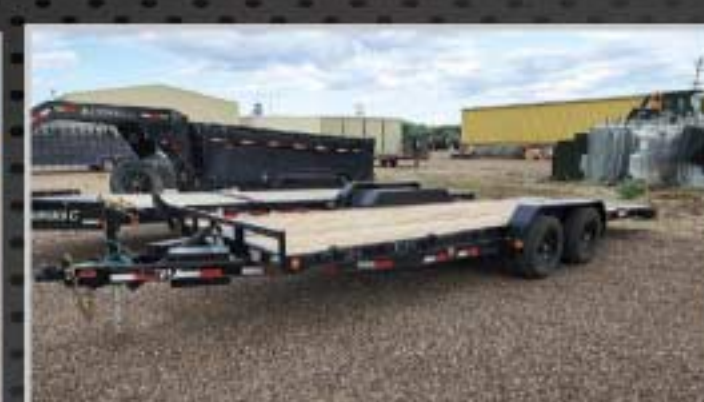
2022 PJ Tilt Trailer 22 ft.