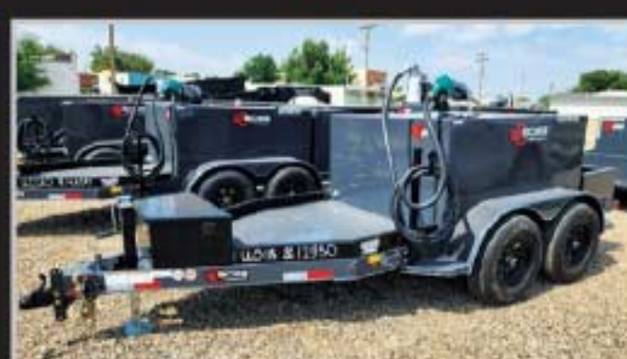
2022 Boss Trailer 590-Gallon Fuel Trailer Open Front, Rear Box, Electric 25 Gpm Pump With Auto Nozzle 20 ft. Hose, Solar Charger