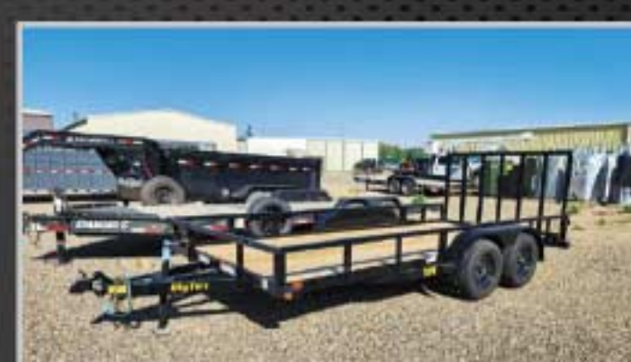
2024 Big Tex Utility Trailer 7x16 4 ft. Ramp