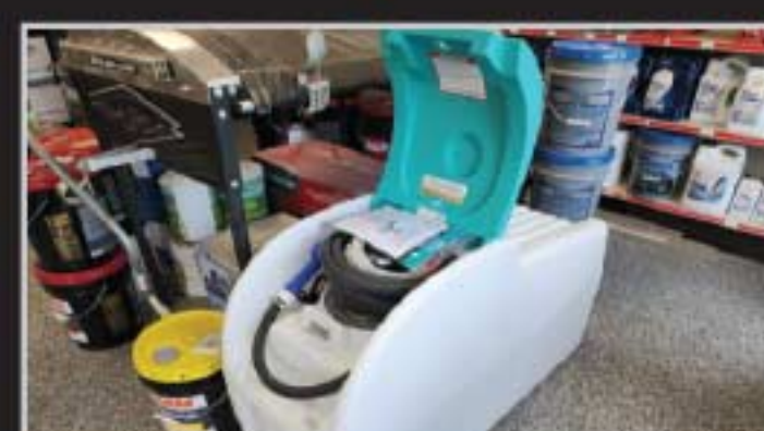
DEF Tank 75 Gallon with Pump Kit, 20' Hose, will fit in front compartment of Boss Trailers!