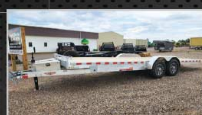
2023 H&H Aluminum Tilt Deck Trailer 82 In. X 24 ft., Extra Toolbox, Spare Tire, Removable Fenders