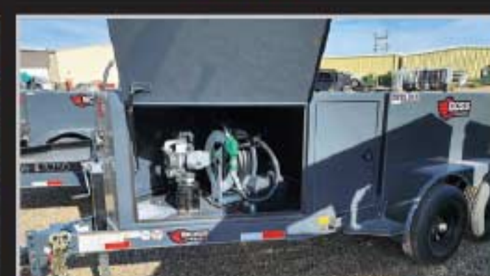
2024 Boss Trailer 590-Gallon Fuel Trailer 25 Gpm Electric Pump, 35 ft Hose Reel, Front Enclosure Rear Box