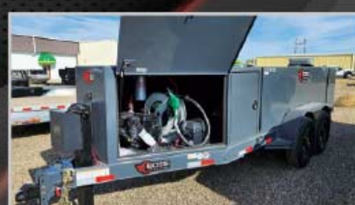
2024 Boss Trailer 990-Gallon Fuel Trailer Kohler Pump 45 Gpm, 35 ft. Hose Reel, Front And Rear Enclosure, Aluminum Wheels, Hydraulic Jack, Spare Tire