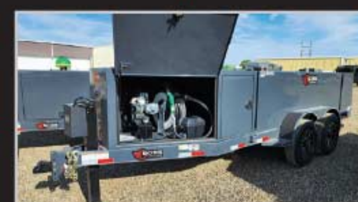
2024 Boss Trailer 990-Gallon Fuel Trailer 25 Gpm Electric Pump, 35 ft Hose Reel, Front And Rear Enclosure, Aluminum Wheels And Spare Tire, Hydraulic Jack.