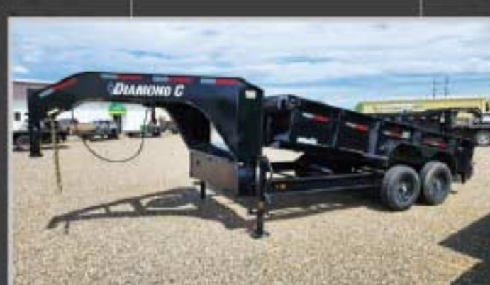
2022 Diamond C Gooseneck Dump Trailer 14 ft. With Tarp