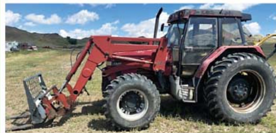
CASE IH 5250 MAXXUM MFWD TRACTOR 3 pt., Dual PTO, 9500 hours & Case IH 520 Front-end Loader w/bucket & grapple

(18) BLACK 2-year-old HEIFERS, (6) ANGUS/CHAROLAIS & (1) REGISTERED 2-year-old ANGUS BULL (from Maus Angus) Bull was turned out June 26, 2023.