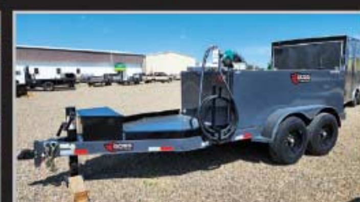
2023 Boss Trailer 990-Gallon Fuel Trailer Open Front, Electric 25 Gpm Pump, 20 ft. Hose Auto Nozzle, Solar Charger