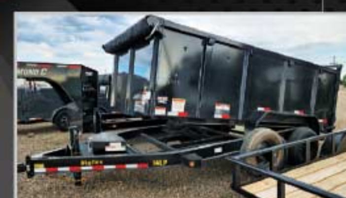
2024 Big Tex Dump Trailer 14 ft. Bumper Pull High Sides